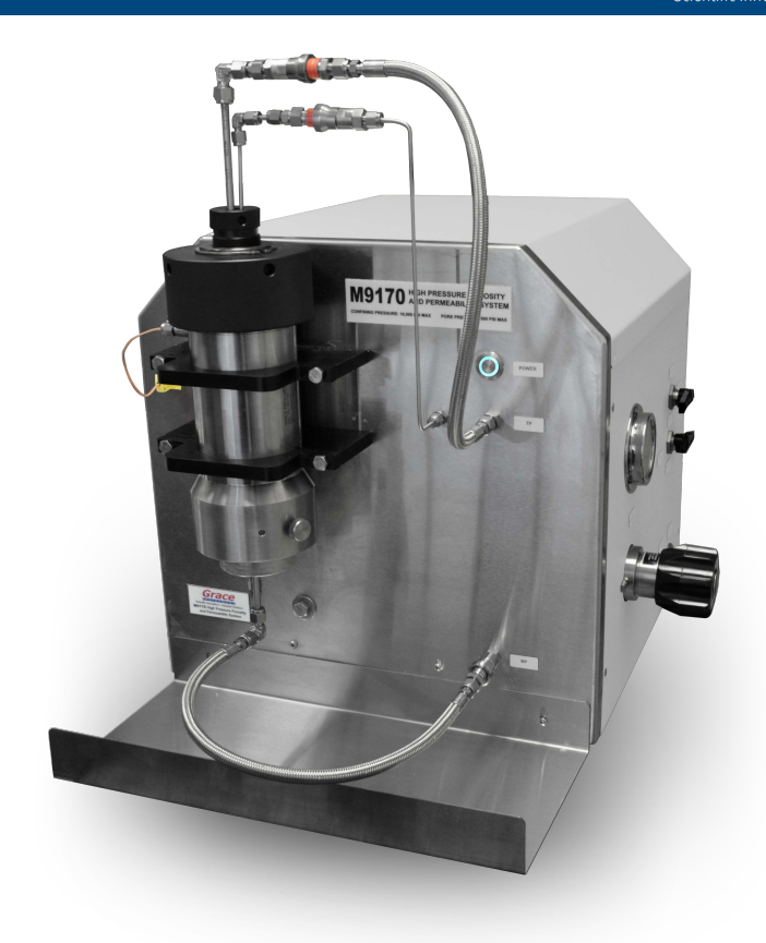
M9170 High Pressure Porosity and Low/High Permeability System

Scientific Innovations. Industrial Solutions