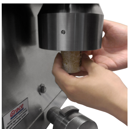
Loading Core Samples is Easy